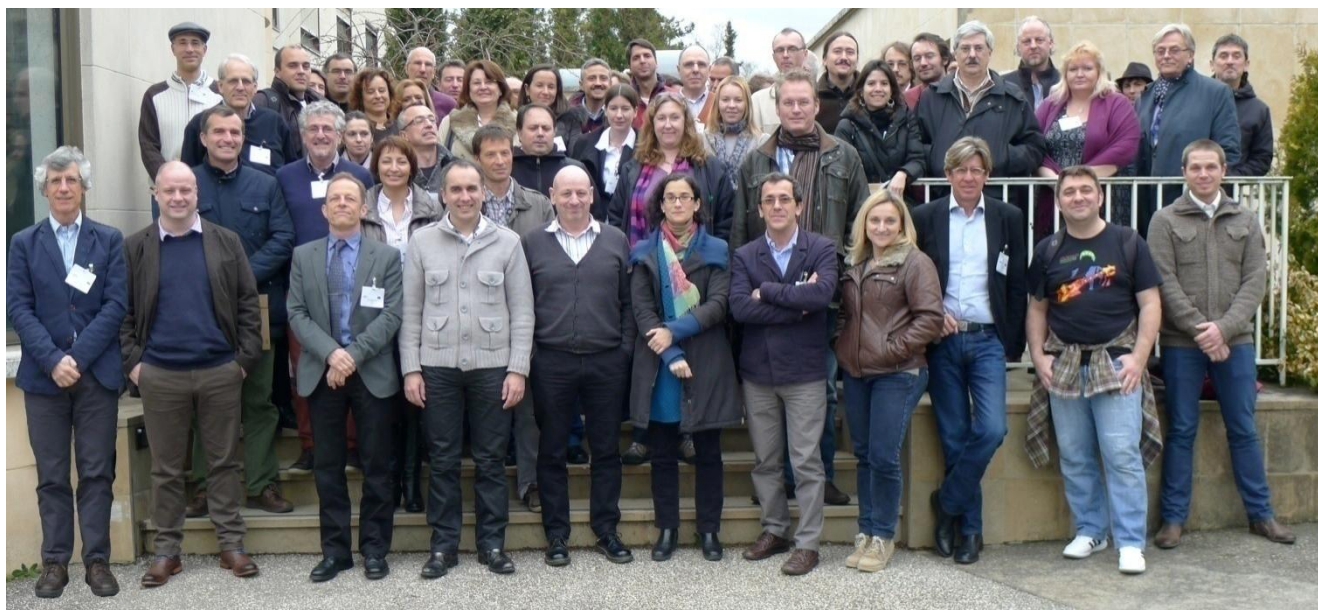
Participants of the LEGATO Kick-off meeting, Dijon, France, 4-5 March 2014

(from the press release at the EU Cordis web site)